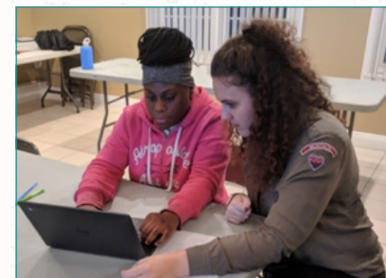
A Peer Mentorship Program in action at John Carroll University SPS chapter.

Examples: Facebook, GroupMe, Slack, LinkedIn (especially useful for alumni connection), Instagram