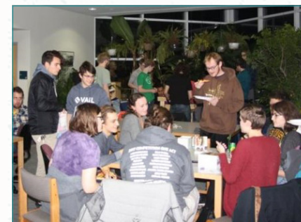
Coe Physics club members at the 2018 annual physics holiday party with professors.