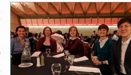
A peer mentorship program in action at the John Carroll University SPS chapter.

Give students an opportunity to form a group to study for the physics GRE. This can include a wide variety of study materials such as problem sets and information on test taking strategies.